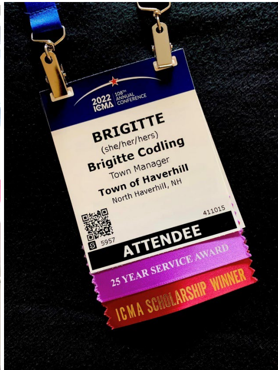
ICMA Scholarship Winners from across the country